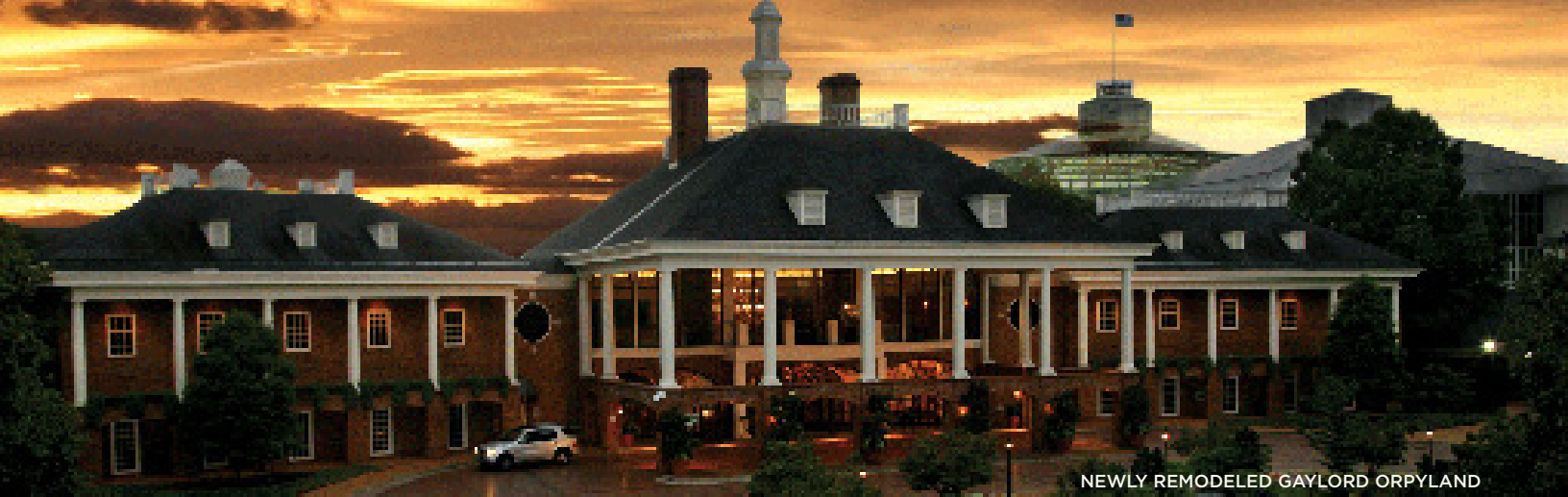
NEWLY REMODELED GAYLORD ORPYLAND